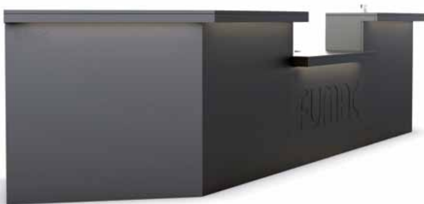
Indgravering i frontplader - eksempelvis logo. Lys kan integreres i udhæng på skranketoppene. Ingraved text in front panels is available on special order. Downlights can be integrated in overhang in counter tops.