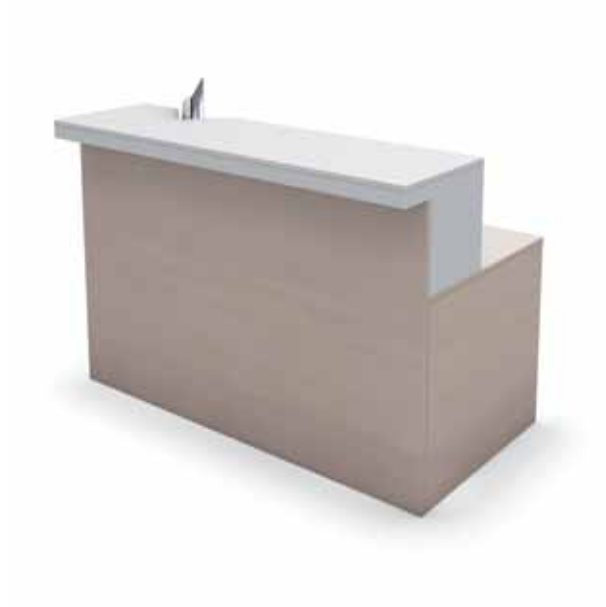
Model 19134 + 19850 Dimension: L: 160 cm D: 80 cm. H: 72/110 cm